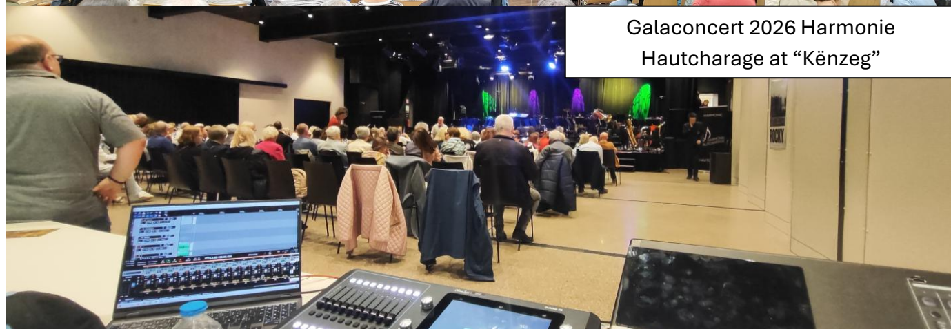
Galaconcert 2026 Harmonie Hautcharage at "Kénzeg"