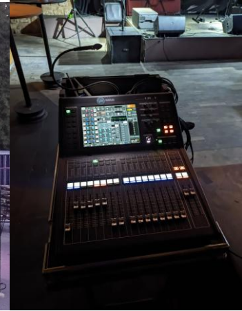
Naomi Ayé at Gudden Wällen