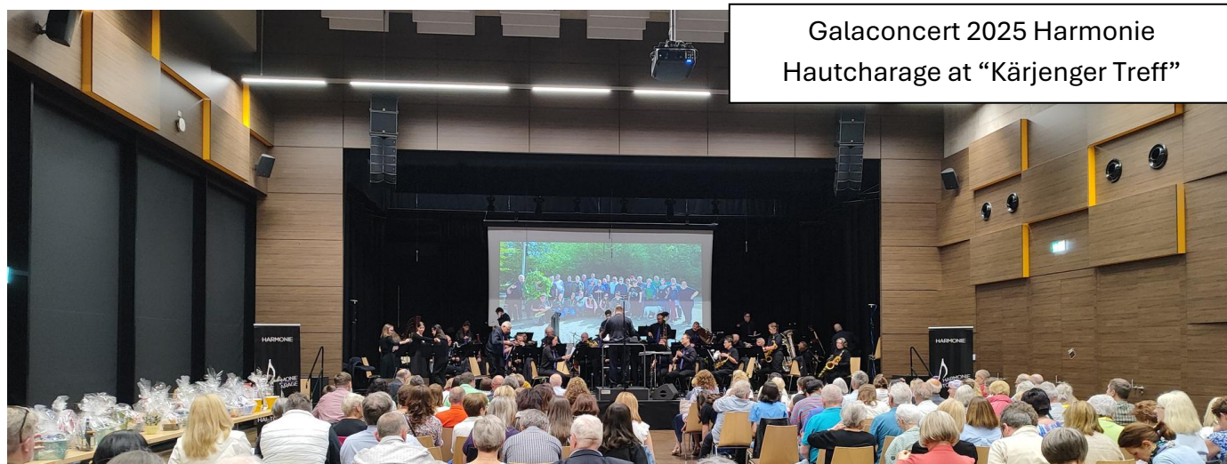
Galaconcert 2025 Harmonie Hautcharage at "Kärjenger Treff"