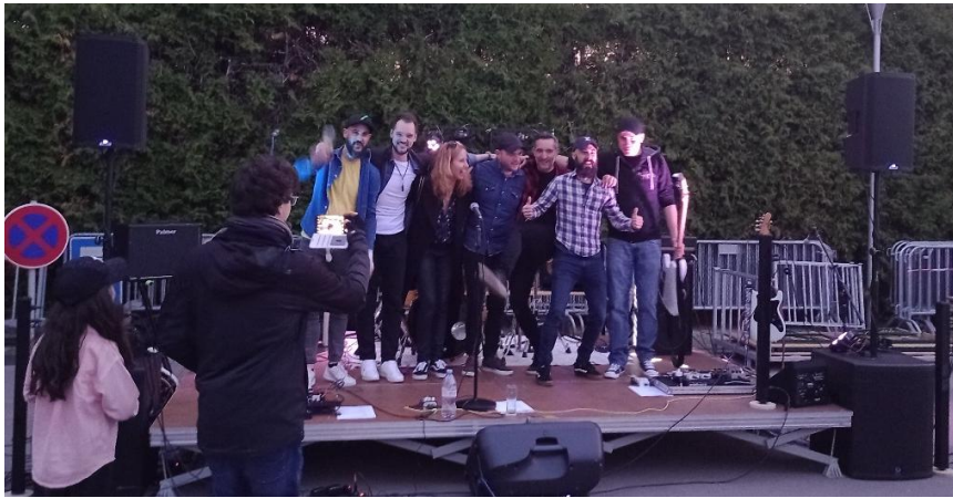
“My Freezer Hero” and “The Kools” in Nideranven with my own PA and lights