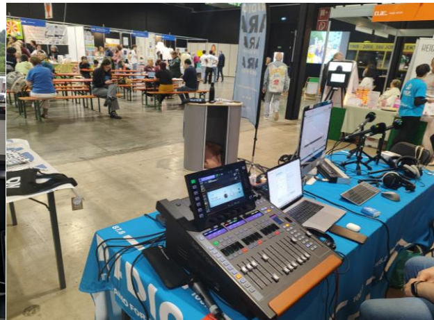
Radio ARA Outside Broadcast at the Festival des migrations

Rythmic Soulwave at Rocas Café: https://www.youtube.com/watch?v=hZWg79x1kEc