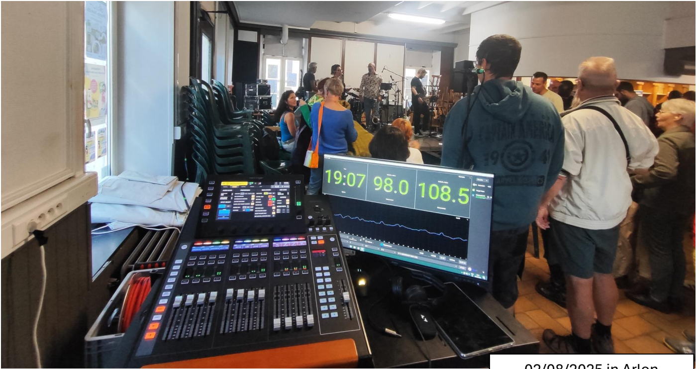
02/08/2025 in Arlon